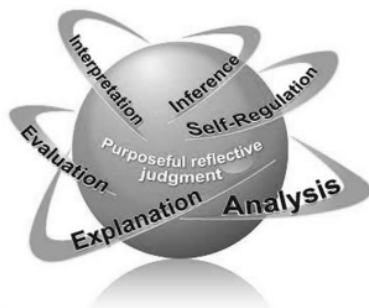
Figure 1. The Essence of Critical Thinking

decision making. It is also possible that explicit instruction in critical thinking causes students to transfer the skills taught in class into their lives. Finally, it is not known whether critical thinking affects all aspects of decision making equally or whether certain decisions (e.g. financial and health decisions) benefit more from the application of critical thinking skills than other decisions (e.g. interpersonal decisions) [10]. Cognitive skills here that become the core of critical thinking include interpretation, analysis, evaluation, conclusions, explanations, and self-regulation [11], which are shown in Figure 1.